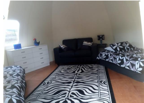
16 sqm Breezepod Interior