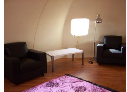
30sqm Breezepod, Interior