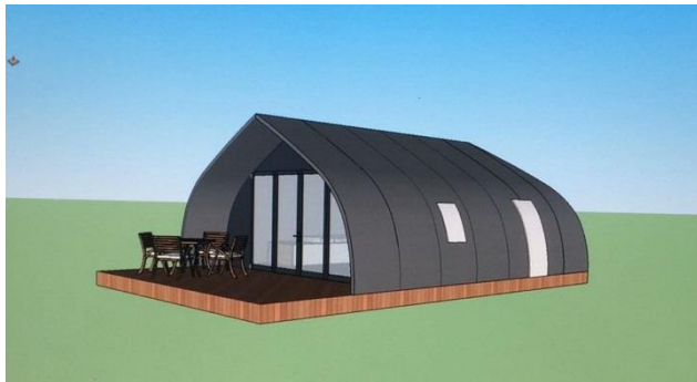
30 sqm extended