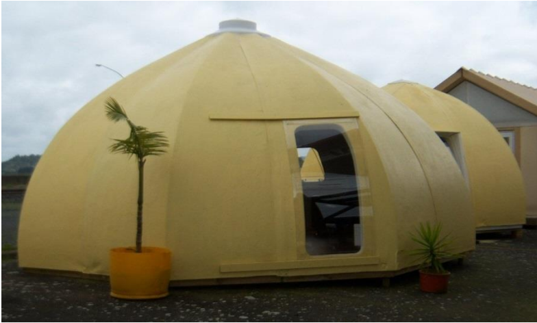
30sqm Breezepod, dimension across the flat of the Octagon is 5960 outside meas.