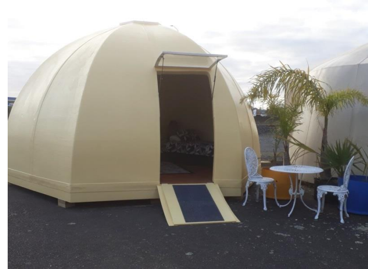
16 sqm Breezepod, dimension across flat of hexagon is 4320 outside